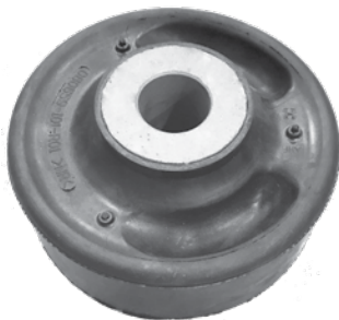
Figure 1: Hendrickson's QUADRA-FUNCTIONAL™ (QF I) Bushing

Narrow bushing tools purchased before 2020 included a rear drive plate with four alignment pins. Only two are required for removal and installation of Hendrickson's narrow TF III bushings. When used with Hendrickson's QF I bushing (Figure 1), two of the four existing alignment pins must be removed due to interference.