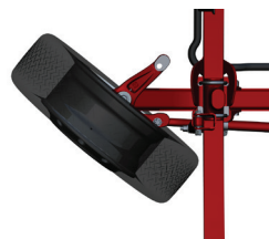
Optimized steering system — 55-degree wheel cut