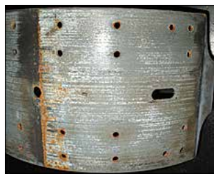
Hendrickson AAXTREME COAT