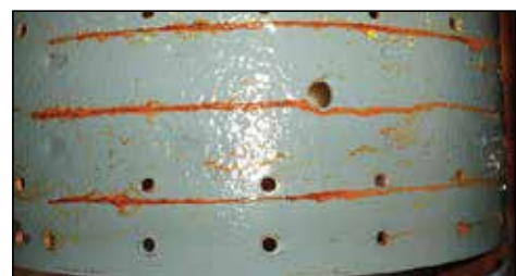
Competitor Premium Coating