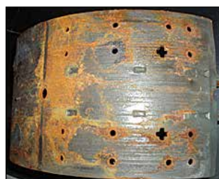
Competitor Premium Coating