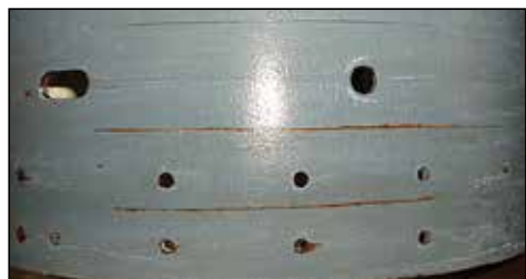
Hendrickson AAXTREME COAT

AAXTREME COAT premium brake coating withstood over 1,000 hours of salt spray testing and rigorous cyclic corrosion testing designed to mimic real-world environmental conditions.