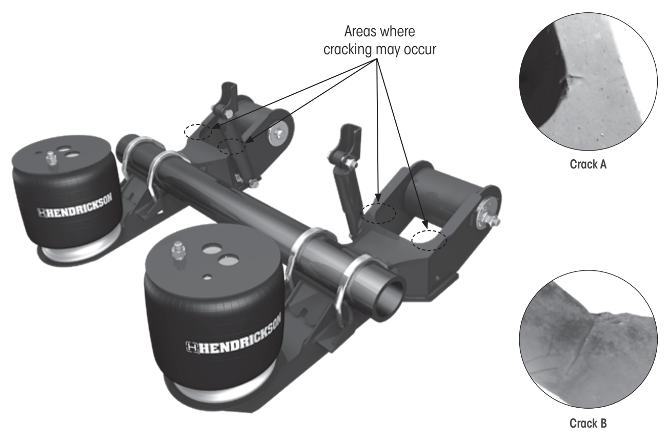
Figure 2: HT250YS Y-beam inspection areas

For assistance in the United States and Canada, call Hendrickson Trailer Technical Services at 866-RIDEAIR (743-3247) or email HTTS@Hendrickson-intl.com