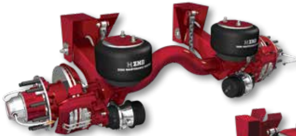
INTRAAX® AAT 23K / 25K