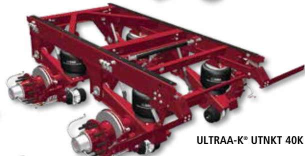
ULTRAA-K® UTNKT 40K