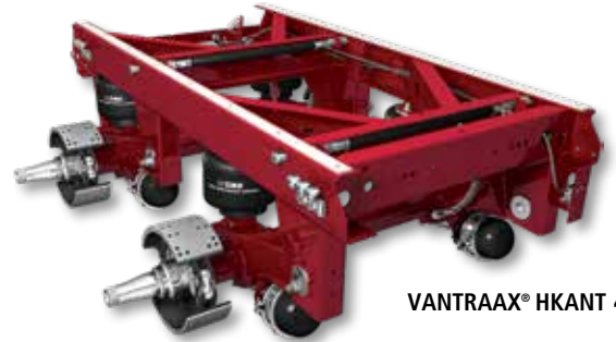
VANTRAAX® HKANT 40K