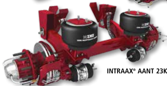
INTRAAX® AANT 23K