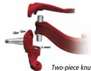
Two-piece knuckle design