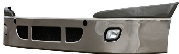
Cascadia Bumper used in fuel consumption test procedure

In relation to the trucking industry, air displacement affects the way a vehicle accelerates, how it handles on the road and how it consumes fuel. A manufacturer's greatest opportunity to manipulate the drag coefficient is through surface area, i.e. size and shape. The graph on the following page best illustrates shape and the resulting drag coefficients.