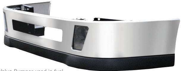
Volvo Bumper used in fuel consumption test procedure