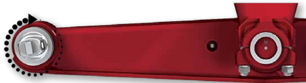
R™ • RS™ • RT™ • RTE™