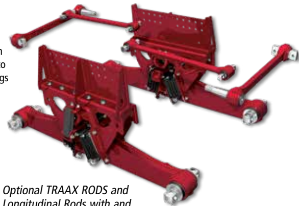
Optional TRAAX RODS and Longitudinal Rods with and without dampers for specific applications or markets

Technical literature available at www.hendrickson-intl.com or contact Hendrickson at 855.743.3733.