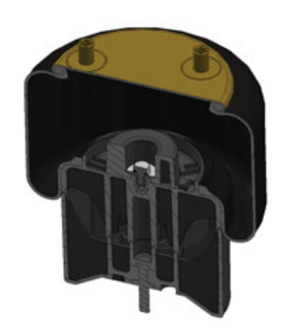
Anatomy of a ZMD® Air Spring

ZMD's unique approach to suspension damping helps address one of the biggest issues facing the commercial vehicle industry today - drivers. Unsolicited comments from tractor/trailer operators report an improved driving experience. Once they've tried it, drivers usually request trailers with ZMD over conventional air suspension systems.