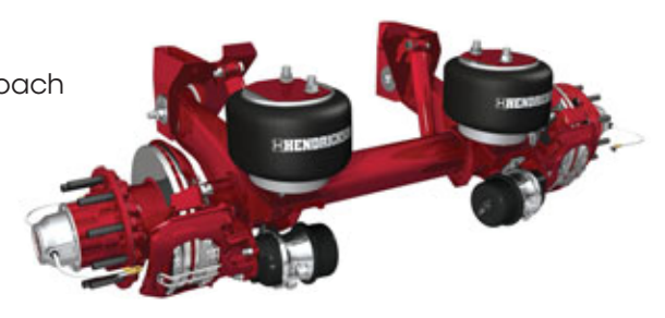
INTRAAX® Integrated Air Suspension System

Trailer air suspensions offer yet another approach to suspension damping. Air suspensions use air springs instead of leaf springs as an interface between the axles and the trailer. The air springs act as trailer isolators, reducing the number of road inputs that are transmitted into the trailer while providing many of the same benefits mentioned with the mono-leaf design. Traditionally, the air spring's main role has